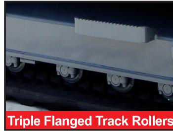
Triple Flanged Track Rollers