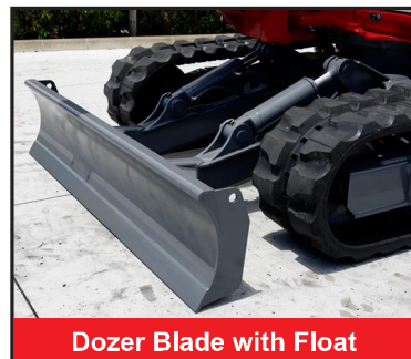
Dozer Blade with Float