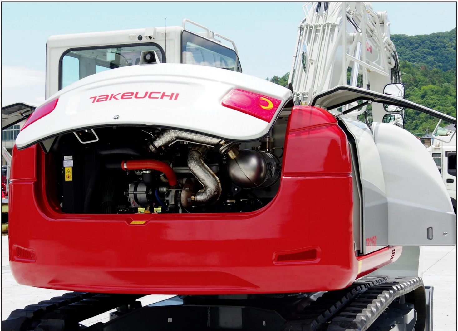
Large lockable service hood provide vandalism protection and outstanding maintenance access.

Additional features include up to four auxiliary hydraulic circuits (option) for greater attachment versatility, boom and arm holding valves for added protection, and a large wrap around counterweight for stability.