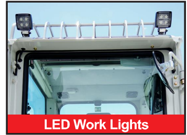
LED Work Lights

The new TB2150 hydraulic excavator delivers greater functionality, performance, comfort, and serviceability.