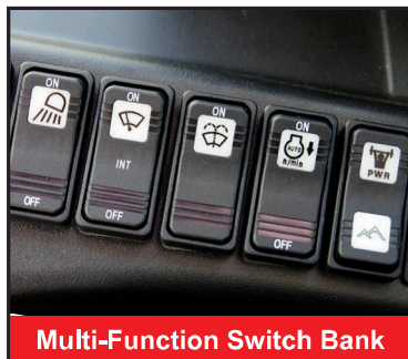
Multi-Function Switch Bank