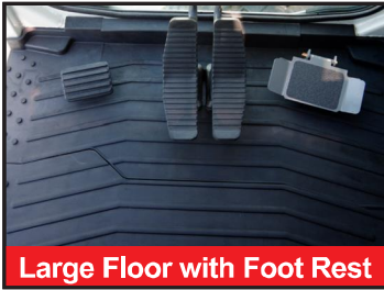
Large Floor with Foot Rest