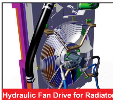
Hydraulic Fan Drive for Radiator