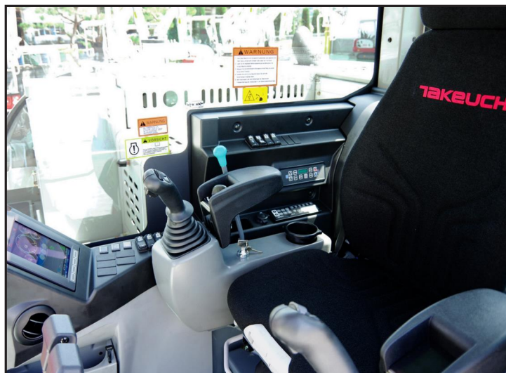
Automotive Styled Interior